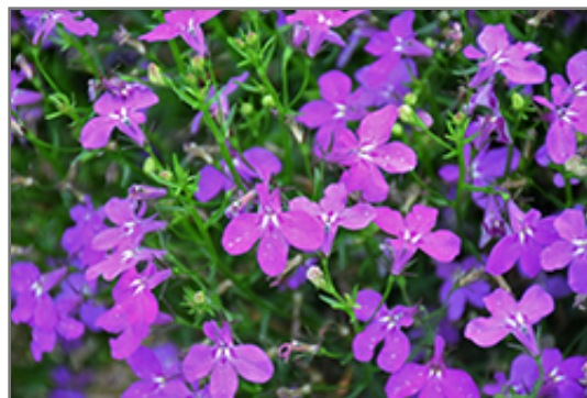
Hot Purple Lobelia flowers