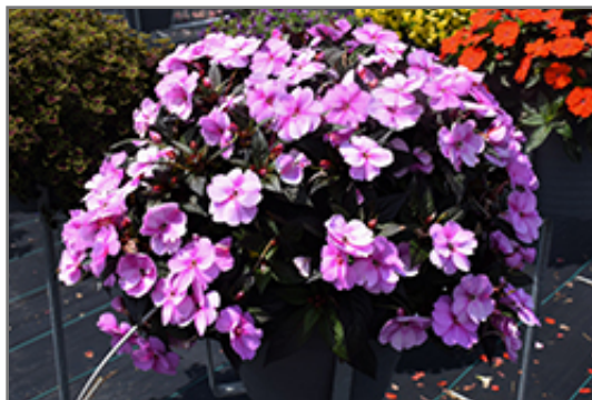
SunPatiens Vigorous Lavender Splash New Guinea Impatiens in bloom

SunPatiens Vigorous Lavender Splash New Guinea Impatiens is a fine choice for the garden, but it is also a good selection for planting in outdoor containers and hanging baskets. Because of its height, it is often used as a 'thriller' in the 'spiller-thriller-filler' container combination; plant it near the center of the pot, surrounded by smaller plants and those that spill over the edges. It is even sizeable enough that it can be grown alone in a suitable container. Note that when growing plants in outdoor containers and baskets, they may require more frequent waterings than they would in the yard or garden.