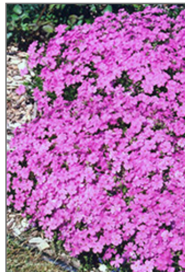
Arctic Phlox flowers