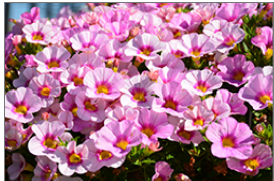
Hula Appleblossom Calibrachoa flowers