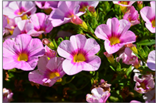
Hula Appleblossom Calibrachoa flowers

Hula Appleblossom Calibrachoa is recommended for the following landscape applications;