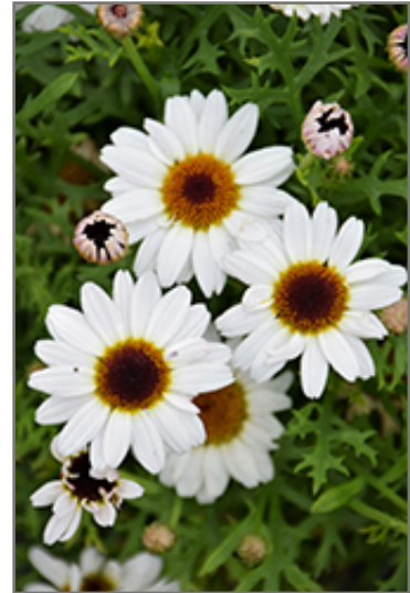
Grandaisy White Daisy flowers