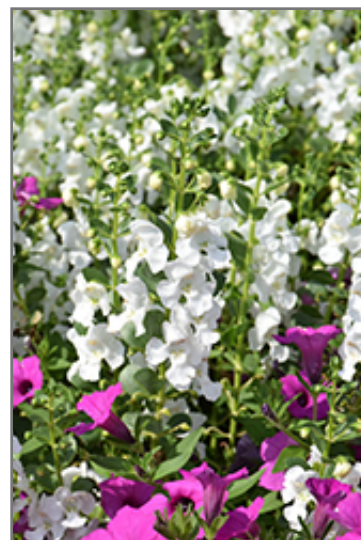
Alonia Snowball Angelonia flowers

Alonia Snowball Angelonia is an herbaceous annual with an upright spreading habit of growth. Its relatively fine texture sets it apart from other garden plants with less refined foliage.