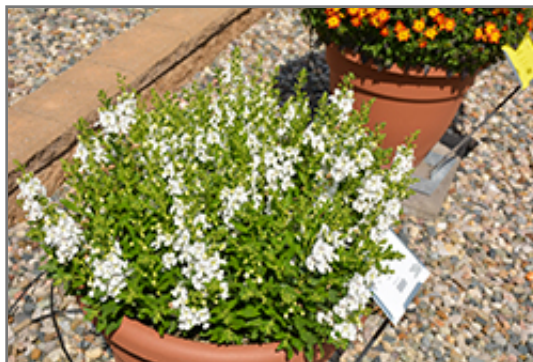
Alonia Snowball Angelonia in bloom

Alonia Snowball Angelonia is a fine choice for the garden, but it is also a good selection for planting in outdoor containers and hanging baskets. With its upright habit of growth, it is best suited for use as a 'thriller' in the 'spiller-thriller-filler' container combination; plant it near the center of the pot, surrounded by smaller plants and those that spill over the edges. Note that when growing plants in outdoor containers and baskets, they may require more frequent waterings than they would in the yard or garden.