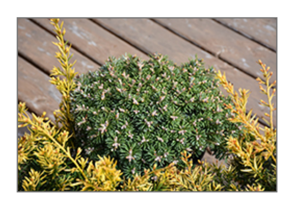
Blue Eskimo Korean Fir

Blue Eskimo Korean Fir will grow to be about 12 inches tall at maturity, with a spread of 12 inches. It tends to fill out right to the ground and therefore doesn't necessarily require facer plants in front. It grows at a slow rate, and under ideal conditions can be expected to live for 60 years or more.