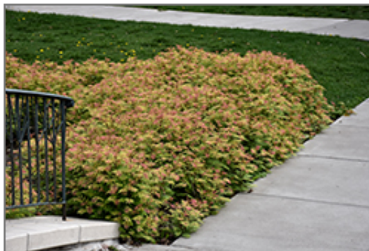
Mai Tai False Spirea

Mai Tai False Spirea makes a fine choice for the outdoor landscape, but it is also well-suited for use in outdoor pots and containers. Because of its height, it is often used as a 'thriller' in the 'spiller-thriller-filler' container combination; plant it near the center of the pot, surrounded by smaller plants and those that spill over the edges. It is even sizeable enough that it can be grown alone in a suitable container. Note that when grown in a container, it may not perform exactly as indicated on the tag - this is to be expected. Also note that when growing plants in outdoor containers and baskets, they may require more frequent waterings than they would in the yard or garden.