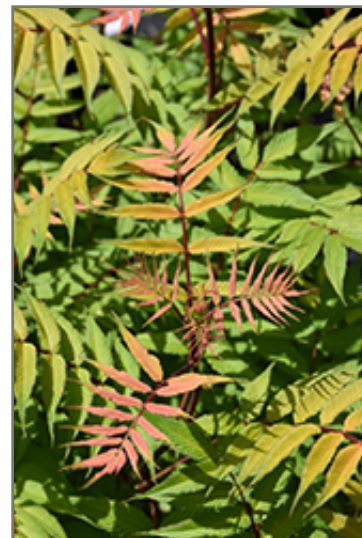
Mai Tai False Spirea foliage