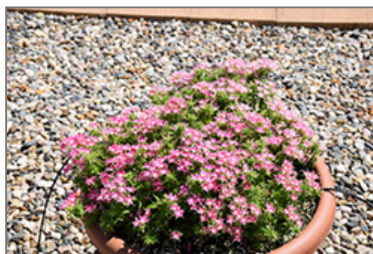
Popstars Rose with Eye Phlox in bloom