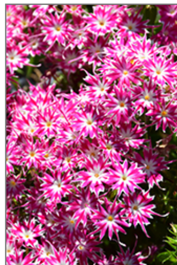
Popstars Rose with Eye Phlox flowers

Popstars Rose with Eye Phlox is recommended for the following landscape applications;