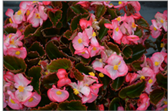
Senator IQ Rose Bicolor flowers