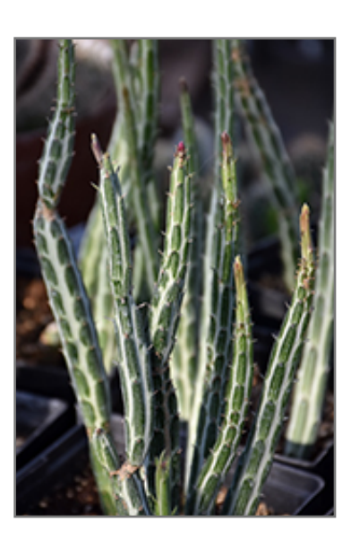
Pickle Plant foliage

When grown indoors, Pickle Plant can be expected to grow to be about 10 inches tall at maturity, with a spread of 18 inches. It grows at a medium rate, and under ideal conditions can be expected to live for approximately 10 years. This houseplant will do well in a location that gets either direct or indirect sunlight, although it will usually require a more brightly-lit environment than what artificial indoor lighting alone can provide. It prefers dry to average moisture levels with very well-drained soil, and may die if left in standing water for any length of time. This plant should be watered when the surface of the soil gets dry, and will need watering approximately once each week. Be aware that your particular watering schedule may vary depending on its location in the room, the pot size, plant size and other conditions; if in doubt, ask one of our experts in the store for advice. It is not particular as to soil pH, but grows best in sandy soil. Contact the store for specific recommendations on pre-mixed potting soil for this plant.