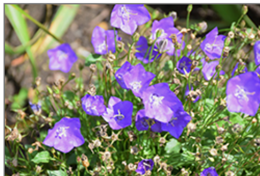
Violet Teacups Bellflower flowers