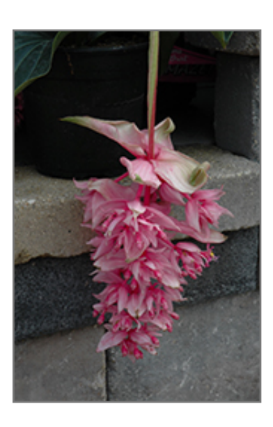
Dolce Vita Medinilla flowers

When grown indoors, Dolce Vita Medinilla can be expected to grow to be about 4 feet tall at maturity, with a spread of 4 feet. It grows at a medium rate, and under ideal conditions can be expected to live for approximately 20 years. This houseplant performs well in both bright or indirect sunlight and strong artificial light, and can therefore be situated in almost any well-lit room or location. It prefers to grow in average to moist soil. The surface of the soil shouldn't be allowed to dry out completely, and so you should expect to water this plant once and possibly even twice each week. Be aware that your particular watering schedule may vary depending on its location in the room, the pot size, plant size and other conditions; if in doubt, ask one of our experts in the store for advice. It is not particular as to soil pH, but grows best in rich soil. Contact the store for specific recommendations on pre-mixed potting soil for this plant.