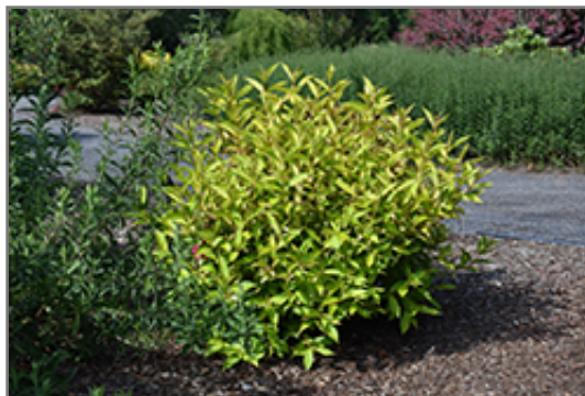
Golden Jackpot Weigela

Golden Jackpot Weigela makes a fine choice for the outdoor landscape, but it is also well-suited for use in outdoor pots and containers. Because of its height, it is often used as a 'thriller' in the 'spiller-thriller-filler' container combination; plant it near the center of the pot, surrounded by smaller plants and those that spill over the edges. It is even sizeable enough that it can be grown alone in a suitable container. Note that when grown in a container, it may not perform exactly as indicated on the tag - this is to be expected. Also note that when growing plants in outdoor containers and baskets, they may require more frequent waterings than they would in the yard or garden.