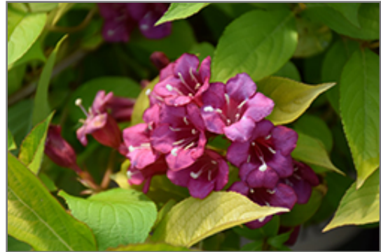
Golden Jackpot Weigela flowers

Golden Jackpot Weigela is recommended for the following landscape applications;