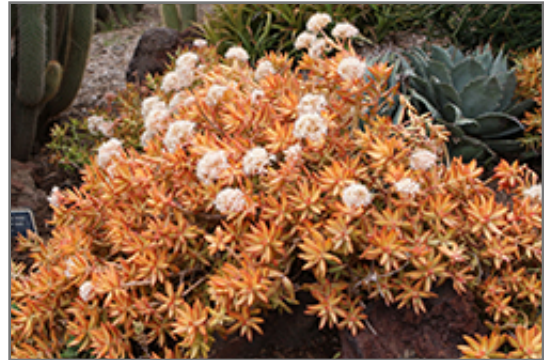
Firestorm Stonecrop in bloom