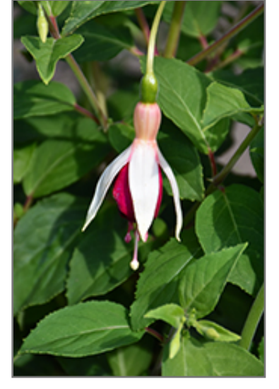
DebRon's Funny Valentine Fuchsia flowers