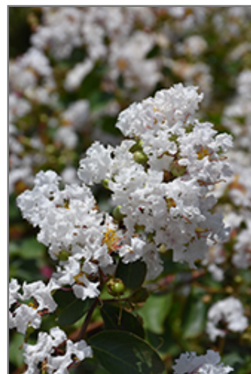
Petite Snow Crapemyrtle flowers