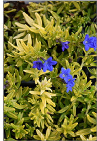
Gold 'n Sapphires Lithodora flowers