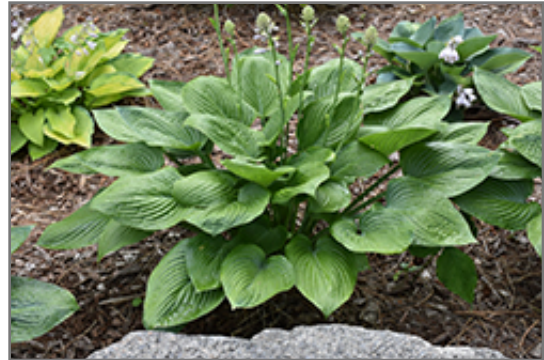
Blue Hawaii Hosta

Blue Hawaii Hosta is recommended for the following landscape applications;