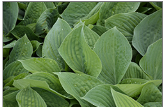
Blue Hawaii Hosta foliage