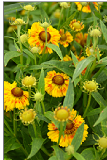
Salud Embers Sneezeweed flowers