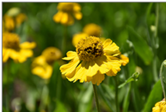
Pumilum Magnificum Sneezeweed flowers