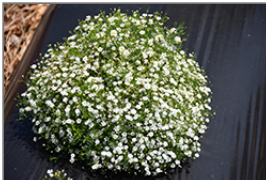
Covent Garden Baby's Breath in bloom