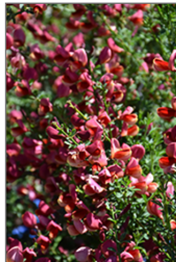
Sister Rosie Scotch Broom flowers