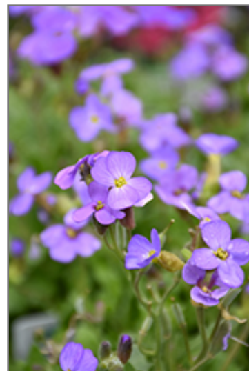
Cascade Blue Rock Cress flowers