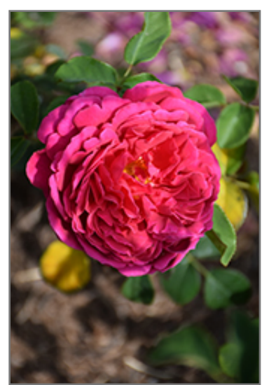
Othello Rose flowers