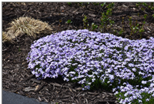
Spring Blue Moss Phlox in bloom

This plant will require occasional maintenance and upkeep, and should only be pruned after flowering to avoid removing any of the current season's flowers. Deer don't particularly care for this plant and will usually leave it alone in favor of tastier treats. Gardeners should be aware of the following characteristic(s) that may warrant special consideration;