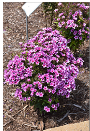
Early Purple Pink Eye Garden Phlox in bloom