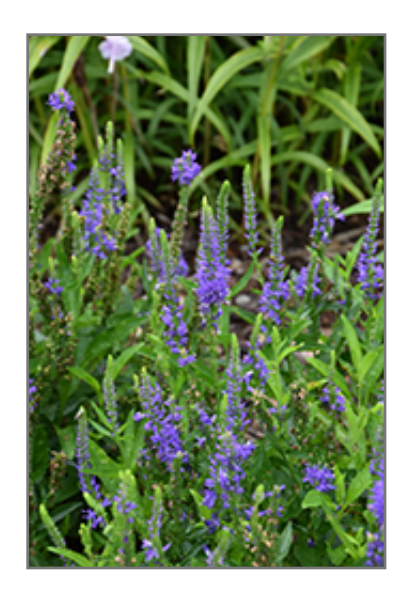
Royal Rembrandt Speedwell flowers

8546 Sun Valley Road Anytown, USA 12345 204.782.4147