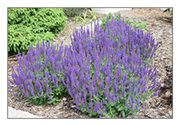
Royal Rembrandt Speedwell in bloom

Royal Rembrandt Speedwell is recommended for the following landscape applications;