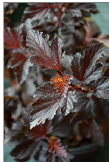
Fireside Ninebark flowers