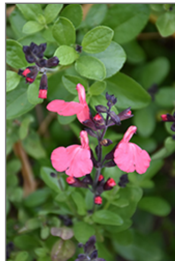
Mirage Salmon Autumn Sage flowers

This is a relatively low maintenance plant, and should only be pruned after flowering to avoid removing any of the current season's flowers. It is a good choice for attracting bees, butterflies and hummingbirds to your yard, but is not particularly attractive to deer who tend to leave it alone in favor of tastier treats. It has no significant negative characteristics.