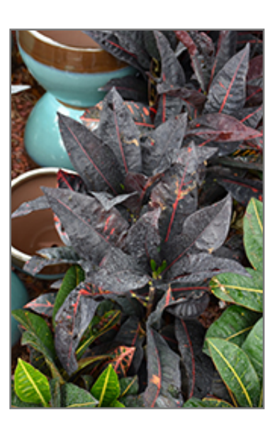
Congo Variegated Croton foliage

When grown indoors, Congo Variegated Croton can be expected to grow to be about 4 feet tall at maturity, with a spread of 3 feet. It grows at a medium rate, and under ideal conditions can be expected to live for approximately 10 years. This houseplant will do well in a location that gets either direct or indirect sunlight, although it will usually require a more brightly-lit environment than what artificial indoor lighting alone can provide. It does best in average to evenly moist soil, but will not tolerate standing water. The surface of the soil shouldn't be allowed to dry out completely, and so you should expect to water this plant once and possibly even twice each week. Be aware that your particular watering schedule may vary depending on its location in the room, the pot size, plant size and other conditions; if in doubt, ask one of our experts in the store for advice. It is not particular as to soil pH, but grows best in rich soil. Contact the store for specific recommendations on pre-mixed potting soil for this plant. Be warned that parts of this plant are known to be toxic to humans and animals, so special care should be exercised if growing it around children and pets.