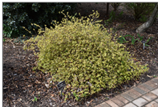
Twist of Orange Glossy Abelia