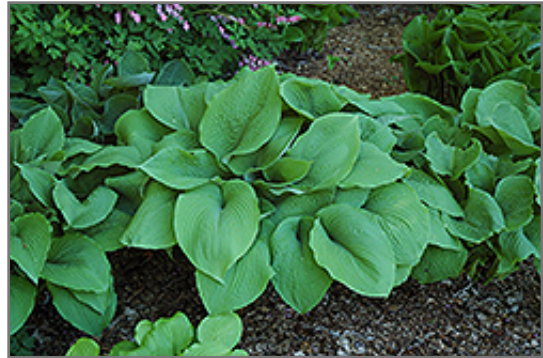
Colossal Hosta