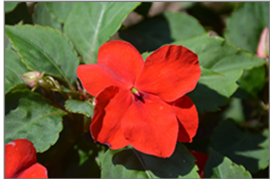
Accent Premium Red Impatiens flowers

Accent Premium Red Impatiens is recommended for the following landscape applications;