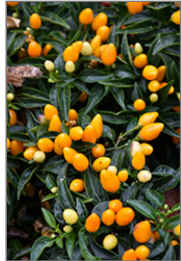
Sedona Sun Ornamental Pepper fruit