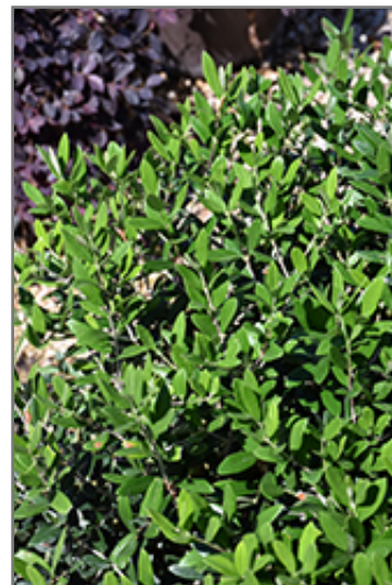
Little Ollie® Dwarf Olive foliage

Little Ollie® Dwarf Olive makes a fine choice for the outdoor landscape, but it is also well-suited for use in outdoor pots and containers. With its upright habit of growth, it is best suited for use as a 'thriller' in the 'spiller-thriller-filler' container combination; plant it near the center of the pot, surrounded by smaller plants and those that spill over the edges. It is even sizeable enough that it can be grown alone in a suitable container. Note that when grown in a container, it may not perform exactly as indicated on the tag - this is to be expected. Also note that when growing plants in outdoor containers and baskets, they may require more frequent waterings than they would in the yard or garden.