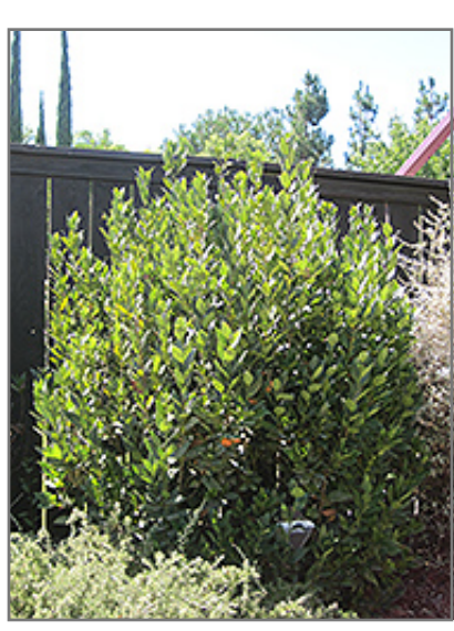
Sweet Bay (shrub form)

When grown indoors, Sweet Bay (shrub form) can be expected to grow to be about 6 feet tall at maturity, with a spread of 4 feet. It grows at a medium rate, and under ideal conditions can be expected to live for approximately 60 years. This houseplant will do well in a location that gets either direct or indirect sunlight, although it will usually require a more brightly-lit environment than what artificial indoor lighting alone can provide. It does best in average to evenly moist soil, but will not tolerate standing water. The surface of the soil shouldn't be allowed to dry out completely, and so you should expect to water this plant once and possibly even twice each week. Be aware that your particular watering schedule may vary depending on its location in the room, the pot size, plant size and other conditions; if in doubt, ask one of our experts in the store for advice. It is not particular as to soil type or pH; an average potting soil should work just fine.