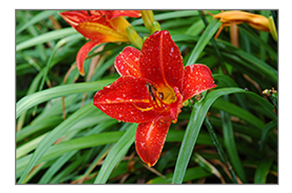
Taiga Fire Daylily flowers