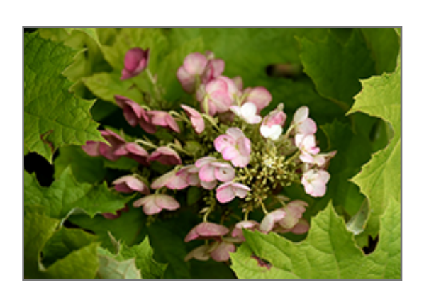
Amethyst Hydrangea flowers