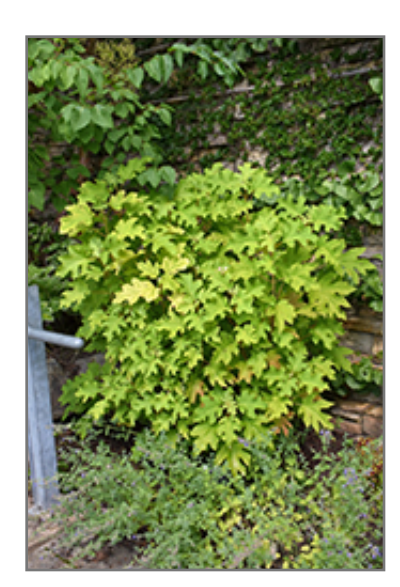
Amethyst Hydrangea