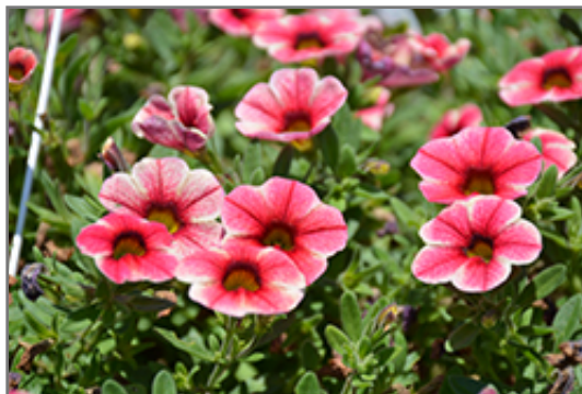
Crave Strawberry Star Calibrachoa flowers

Crave Strawberry Star Calibrachoa is recommended for the following landscape applications;