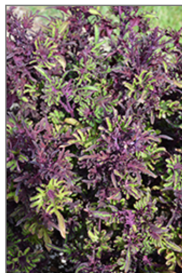
Under The Sea Lime Shrimp Coleus foliage