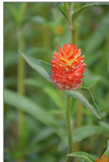
Budacious Outrageous Orange Gomphrena flowers

Budacious Outrageous Orange Gomphrena is recommended for the following landscape applications;