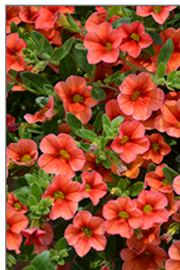
Catwalk Mandarin Glow Calibrachoa flowers