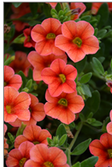
Catwalk Mandarin Glow Calibrachoa flowers

Catwalk Mandarin Glow Calibrachoa is a dense herbaceous annual with a trailing habit of growth, eventually spilling over the edges of hanging baskets and containers. Its medium texture blends into the garden, but can always be balanced by a couple of finer or coarser plants for an effective composition.