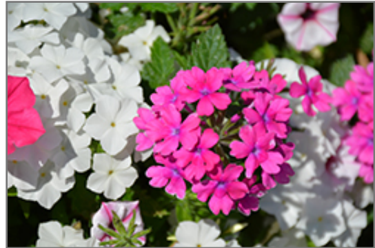
Superbena Pink Shades Verbena flowers

Superbena Pink Shades Verbena is recommended for the following landscape applications;