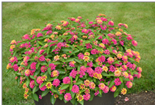
Luscious Royale Cosmo Lantana in bloom

Luscious Royale Cosmo Lantana will grow to be about 18 inches tall at maturity, with a spread of 24 inches. When grown in masses or used as a bedding plant, individual plants should be spaced approximately 18 inches apart. It has a low canopy. It grows at a fast rate, and under ideal conditions can be expected to live for approximately 20 years.