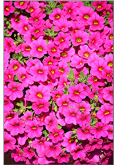
Million Bells Compact Brilliant Pink Calibrachoa flowers

Million Bells Compact Brilliant Pink Calibrachoa is a dense herbaceous annual with a trailing habit of growth, eventually spilling over the edges of hanging baskets and containers. Its medium texture blends into the garden, but can always be balanced by a couple of finer or coarser plants for an effective composition.