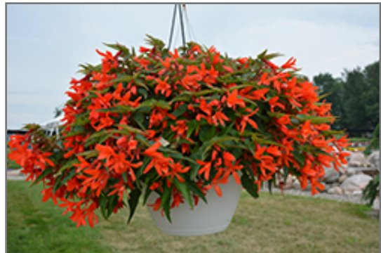
Bossa Nova Orange Shades Begonia in bloom