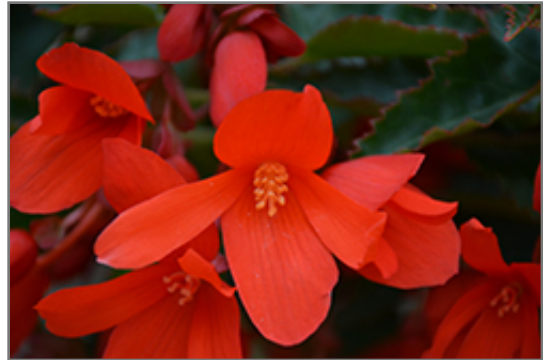
Bossa Nova Orange Shades Begonia flowers