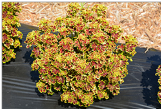
Tidbits Tammy Coleus