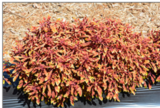
Hipsters Jasper Coleus