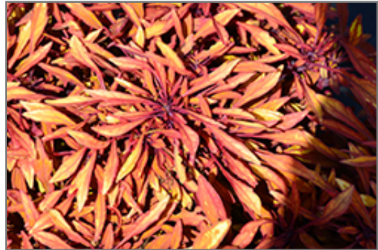
Fancy Feathers Copper Coleus foliage

Fancy Feathers Copper Coleus is recommended for the following landscape applications;